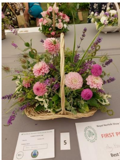
Class F11 - Arrangements For Beginners - Winner - Amy Howes